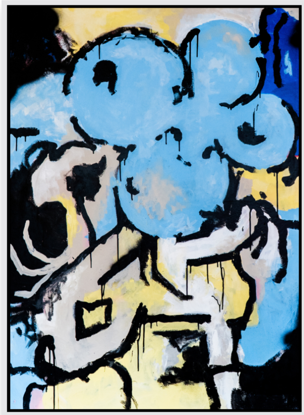
Crumple Seed Enamel and Spray Paint on Canvas 101.8 x 138.7 cm £2400