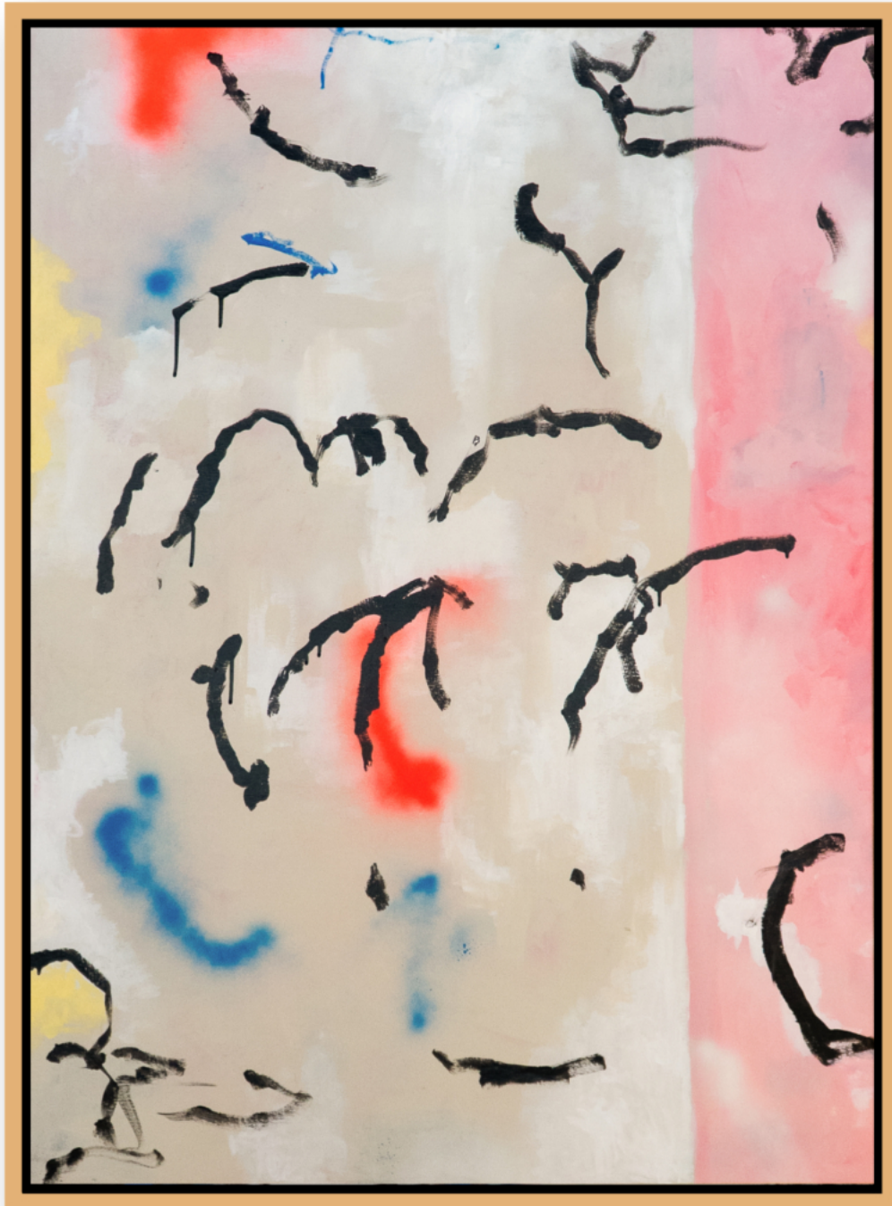
Line Dry Outside Enamel and Spray Paint on Canvas 95 x 128 cm £2400