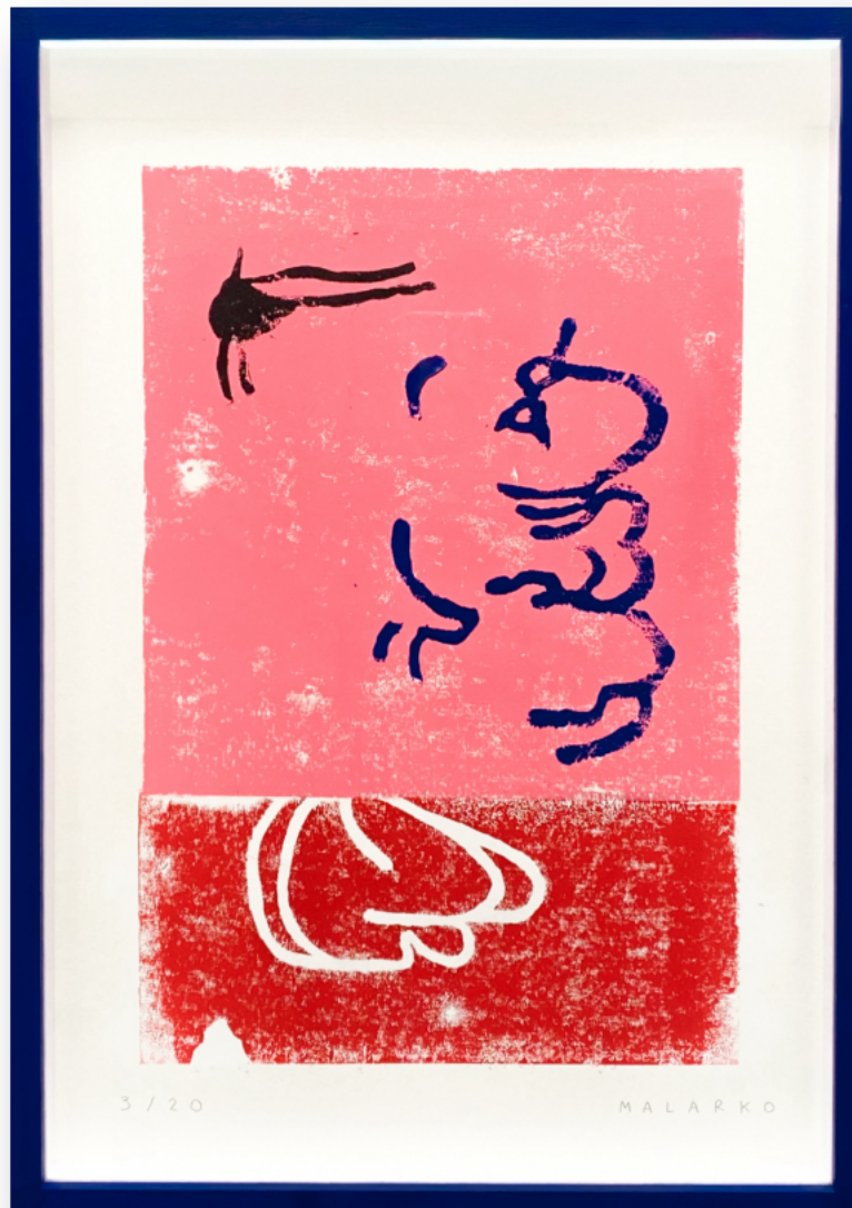
Nine Teas Point Linocut print on 300gsm watercolour paper 29.7 x 42 cm £80 / £160 (Framed)