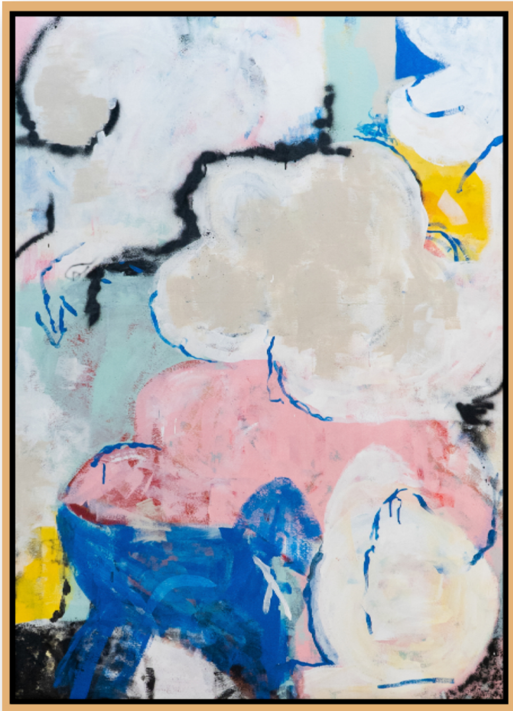
Across The Fountain Enamel and Spray Paint on Canvas 99 x 136 cm £2750