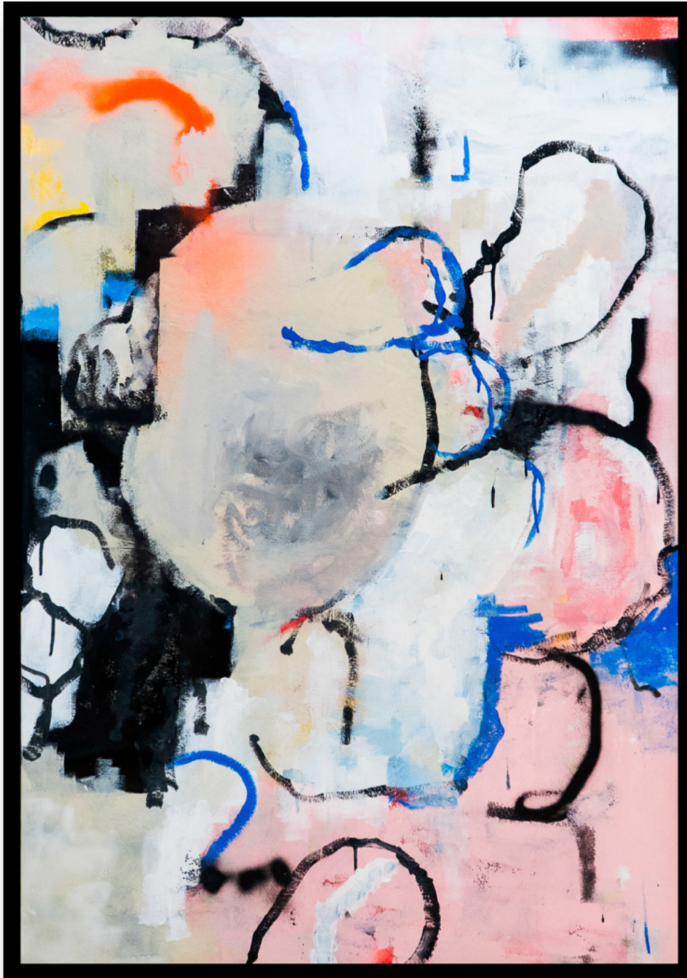
Around By The Corner Enamel and Spray Paint on Canvas 96 x 136 cm £2750