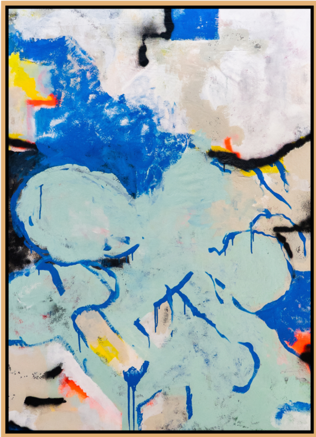
Without Looking Further Enamel and Spray Paint on Canvas 99 x 136 cm £2750