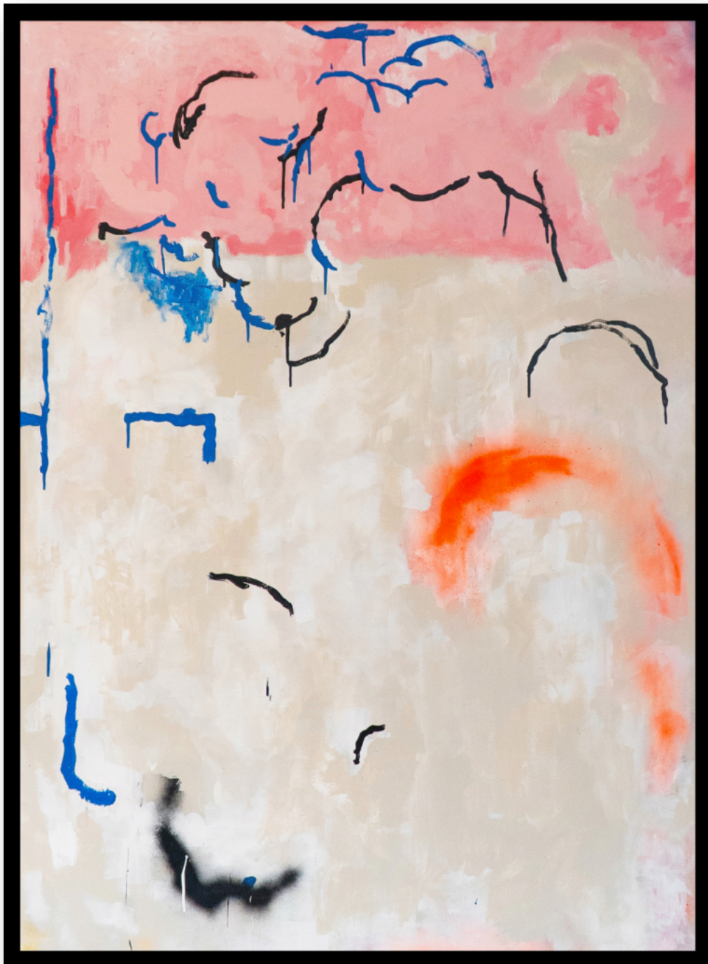
Cacho Mendrugo Enamel and Spray Paint on Canvas 103 x 139 cm £2250