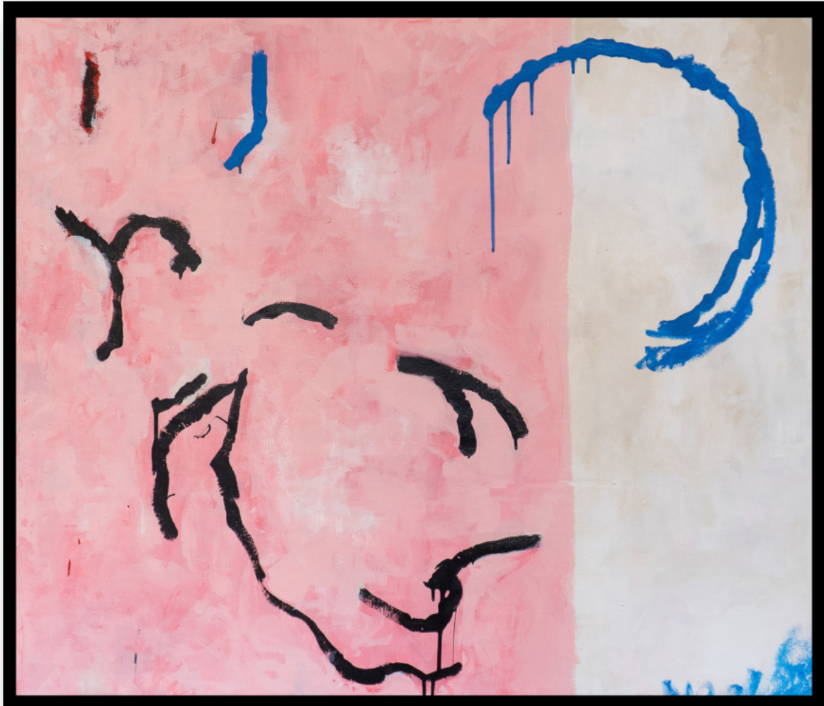
Hang Inside Enamel and Spray Paint on Canvas 102.5 x 87.7 cm £1450