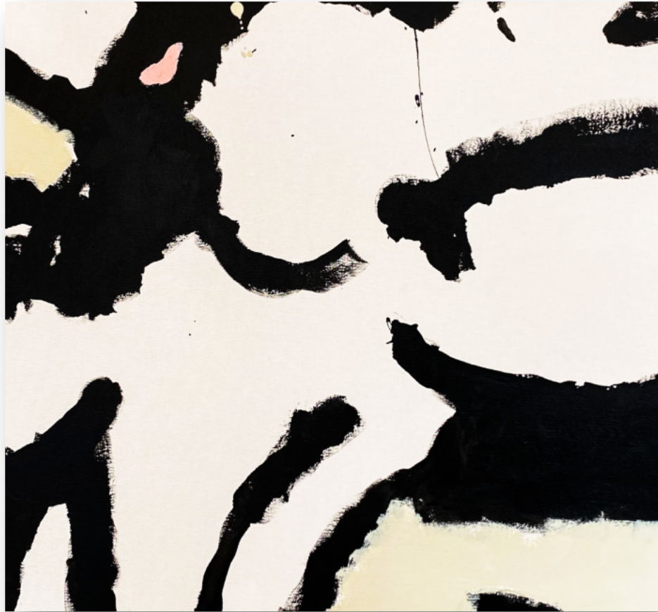
Super Secuestro Enamel and Spray Paint on Canvas 48.2 x 43 cm £400