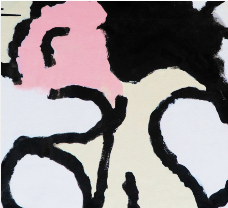
Not A Problem Enamel and Spray Paint on Canvas 48.2 x 43 cm £400