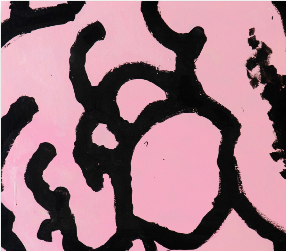
Sáquenme! Enamel and Spray Paint on Canvas 48.2 x 43 cm £400