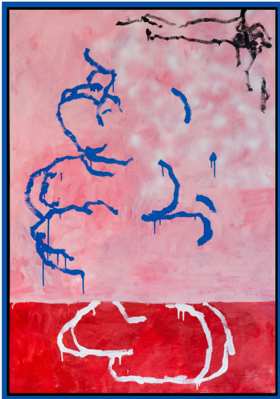
Nine Teas Point Enamel and Spray Paint on Canvas 95.6 x 136 cm £2750