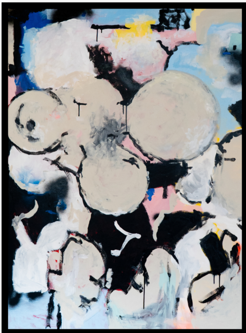
Still Alive Enamel and Spray Paint on Canvas 95 x 128 cm £2250