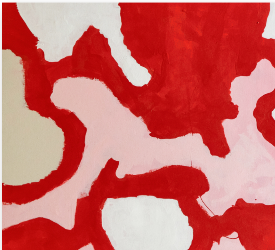
Marcharme Enamel and Spray Paint on Canvas 48.2 x 43 cm £400