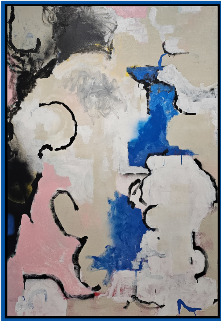
You Should Never Tidy Enamel and Spray Paint on Canvas 95.6 x 139 cm £2500